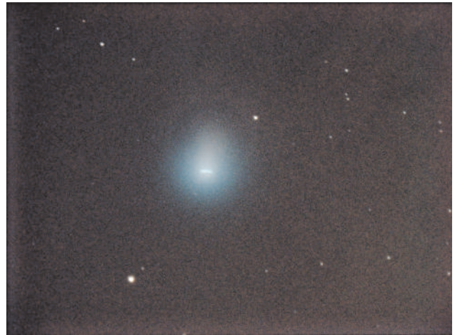
Comet Swan (2006 M4) is a 5-minute exposure showing the bright nucleus of the comet moving rapidly during the exposure.

increase an amateur's ability to see and image comets. Using a planetarium program updated by free data from the Minor Planet Center in America, he showed that many tens of comets and hundreds of asteroids can be identified and imaged in amateur telescopes using sensitive CCD cameras, even in the suburbs. Images of a fast moving asteroid were shown, together with several comets, all imaged from Southampton.