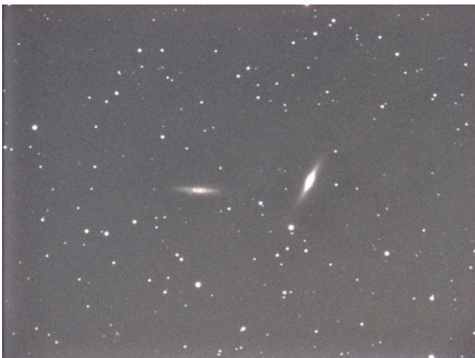
Fig 1: The twin galaxies NGC7332 and 7339 captured in a 10-minute exposure with an SXV-H9C colour camera and a 12" RCX400 guided 'scope

We take a picture of a known galaxy - see figure 1 - or star cluster (rather than a random area of sky). Careful analysis will reveal its limiting magnitude - the magnitude of the faintest star that can be detected in the image. The image can then be 'blinked' with a similar image downloaded from the Deep Sky Survey. The latter images are freely available online. Better still, the image can be retained, and an identical one taken some weeks or months later. The two images are blinked; any changes - hopefully the appearance of a nova - can be detected by eye (or even software). So there is your science. There are many professional nova surveys, and many amateurs are also doing this type of work. If you wish to keep up to date with discoveries, you can subscribe to the IAU (International